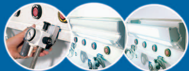
Rail - Support System