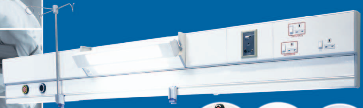
Bed Head Panel-WP220

Nurse Call / TV / Telephone Modules - Additional Electric Module - Gas Module - Basket (accessory / catheter) - Cabinets - ELCB / MCB + Module - Railings - Smart Clamp™ - Room / Examination / Reading Light - Suction Cup and Accessories Tray